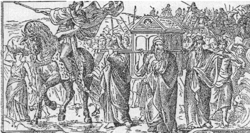
Crossing the Jordan with the Ark