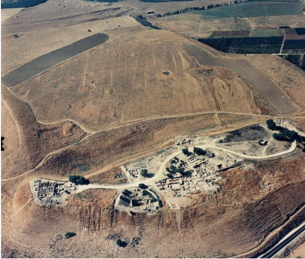
Excavation of Hazor