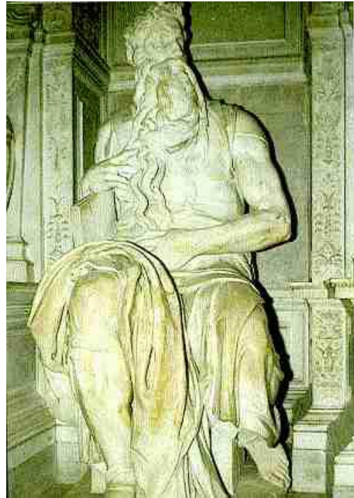
Michelangelo's Statue of Moses

Hebrews 3.5-6 especially focuses on the office of servant: