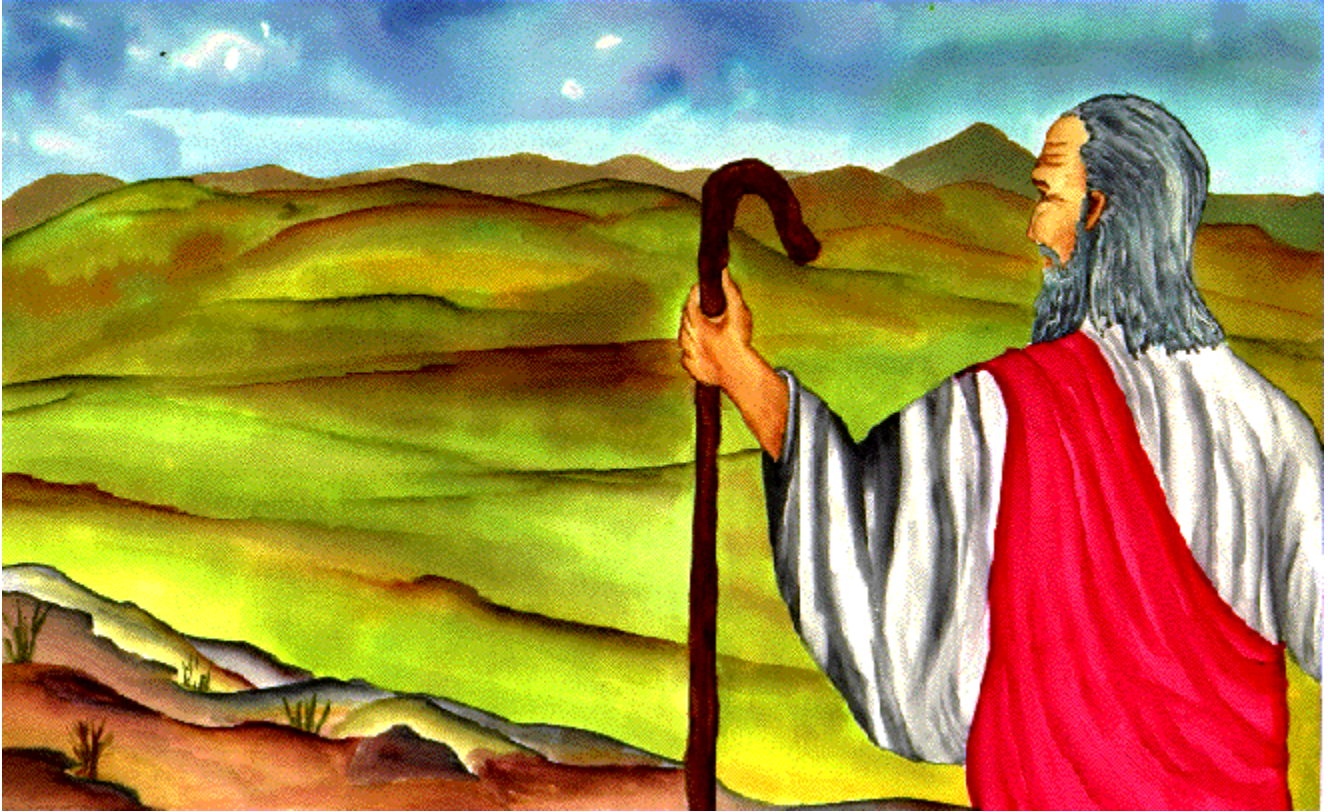
Moses Views the Promised Land