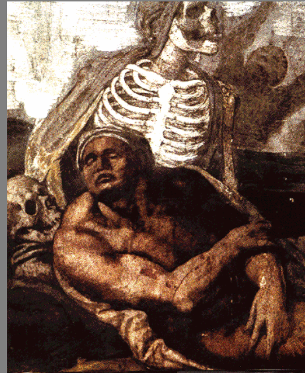
The Resurrection by Michelangelo

4. If God used billions of years to create the world, how will He bring this world to an end ?